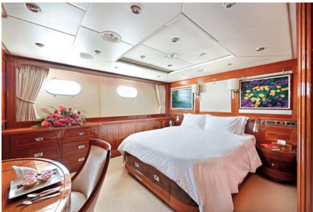
Double Stateroom 1