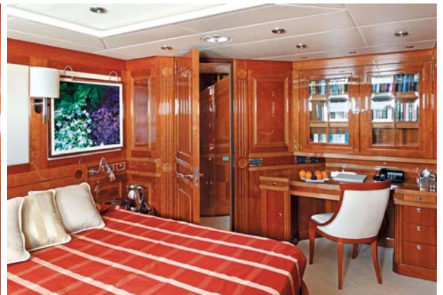
Double Stateroom 2