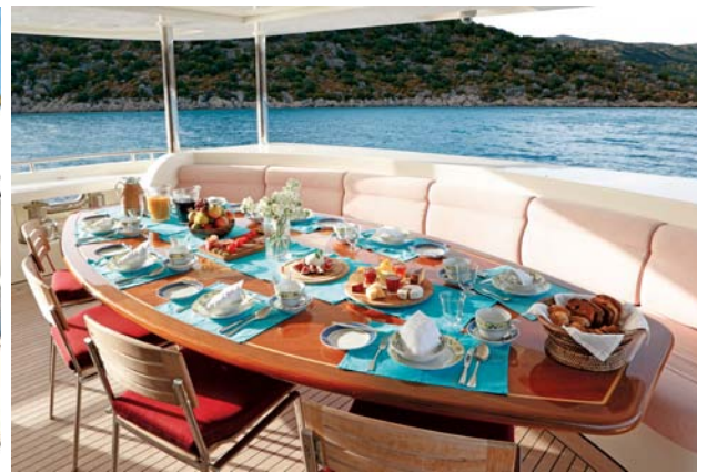
Al Fresco Dining